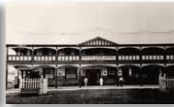
Ocean View Hotel shortly after it was rebuilt in 1927.

9 Belling Street – #39 and # 41 are examples of typical early cottages of the area. The corner of Morgo and Belling Street was originally the Atherton family home and shop. The Police station on the opposite corner was established in 1903.