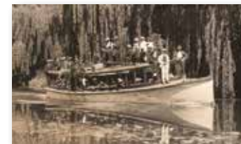
Urunga Belling Motor Launch, 1910.