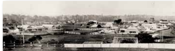
View of Urunga township from Flagstaff Hill.

Timber mills were constructed and the logs were delivered to the various depots along the river banks by bullock teams, then moved to the various mills by numerous paddle wheel Droghers. The timber was transported from the mills to the wharfs at Urunga to be shipped to Sydney. The cutters were followed by farmers who, recognising the rich potential of the river valley's alluvial soils, grew maize and grazed dairy cattle.