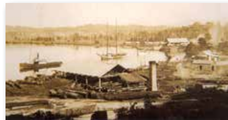
Sawmills at Repton.

as Bellinger Heads) to help the sailing ships across the bar and up the river. The first steam tug arrived on the river in the 1880s. The mouth to the river was always dangerous and inevitably it saw a number of dramatic shipwrecks including the Violet Doepel. The break walls began construction in 1892 but were never completed because of cost overruns and budget constraints. The pilot service continued until 1933, when the tug 'Repton' was wrecked on the break wall.