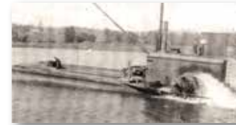
Drogher on the Kalang River, 1925.

Once a thriving sea port, the past 130 years has seen Urunga survive much, as it has grown with the changes in its industry, culture and society. The Urunga of today offers a glimpse of its past with some of the old buildings that still remain.