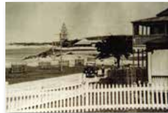
Corner of Morgo and Belling Streets, (now Atherton Court).