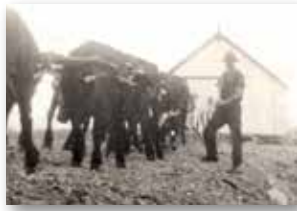
Bullock teams and shed on seawall.