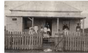
Urunga's first Post Office.