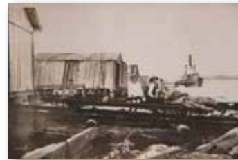
Wharfs at Urunga.

In 1840 William Miles, a stockman from Kempsey, recognised the rich potential of the cedar, which abounded in the area. Cedar cutters moved into the area, cutting the trees and waiting for the floods to move the trunks down to the river mouth.