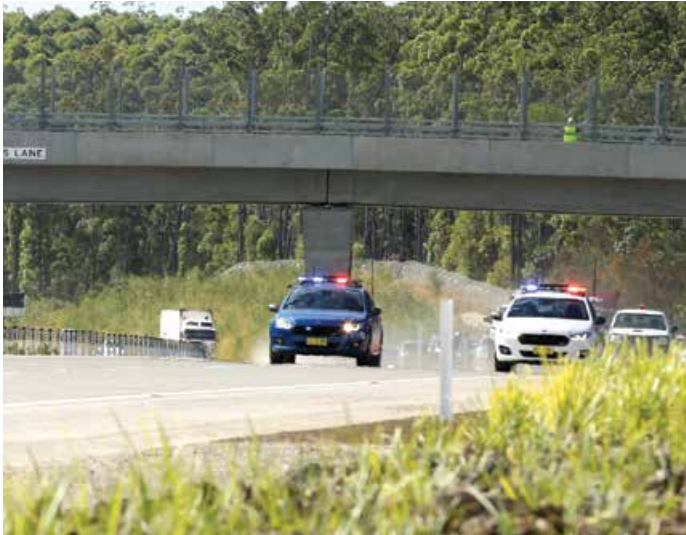
Frederickton to Eungai project opens to traffic

Benefits of the upgrade include improved road safety, better highway alignment, uninterrupted highway traffic flow and easy access on and off the highway for local traffic. New north and southbound rest areas have been installed at Clybucca. The upgrade connects the Kempsey bypass to the existing four lane divided road north of Eungai Rail. This included raising the speed limit of 40 kilometres of highway between South Kempsey and Eungai Rail to 110km/h.