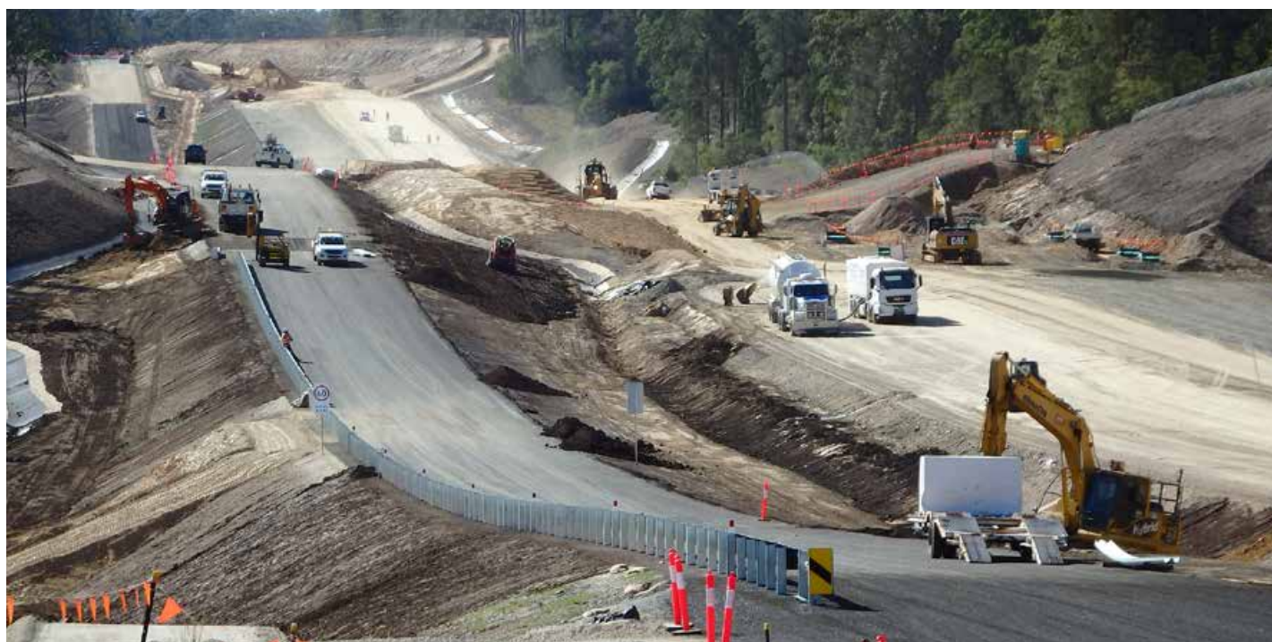
Work on the new Pacific Highway and the local access road

Every attempt will be made to minimise the impact generated by the night work. Motorists are asked to be aware of the roadwork, observe all speed limits and drive safely.