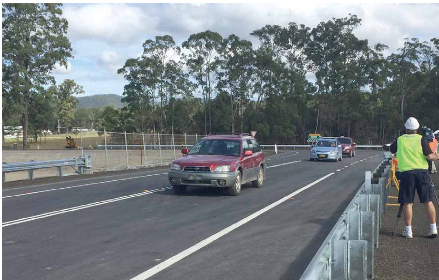
First cars driving on the new Kundabung bridge

In person at the Community Display Centre at the main site compound at Kundabung Road, Kundabung, Monday to Friday between 9am and 5pm (excluding public holidays).