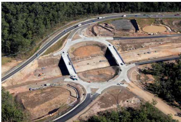
Progress at Blackmans Point Road interchange

The $820 million project involves upgrading 23 kilometres of highway. The project includes building 23 bridges with major river crossings over the Hastings and Wilson rivers and interchanges at Sancrox Road, Blackmans Point Road and Haydons Wharf Road. The project is about 60 per cent complete and expected to open to traffic in 2017.