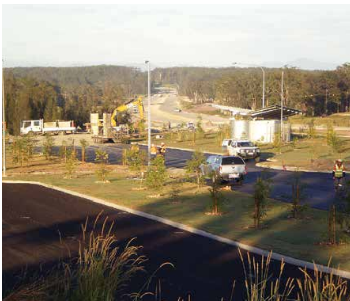
View from the new Clybucca rest area during construction

A small amount of finishing work was required at Frederickton interchange and north of the Stuarts Point interchange. This work was completed in July.