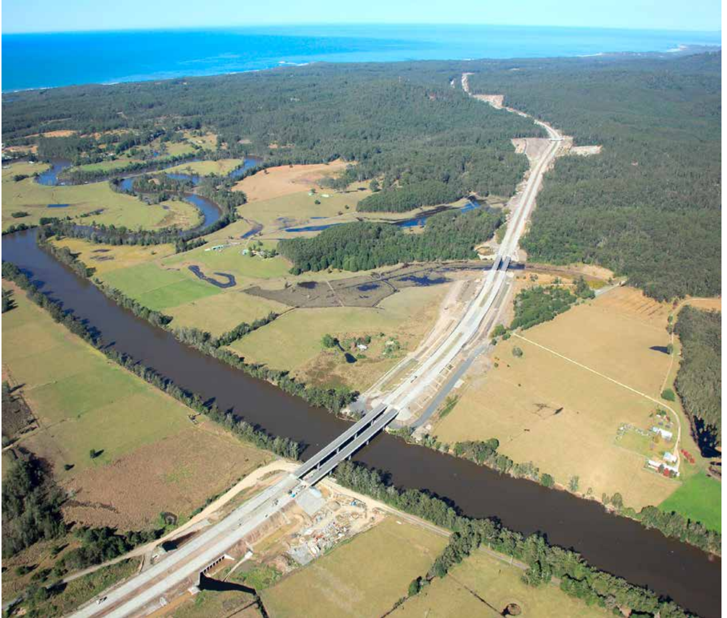
Looking south towards the twin bridges over the Kalang River