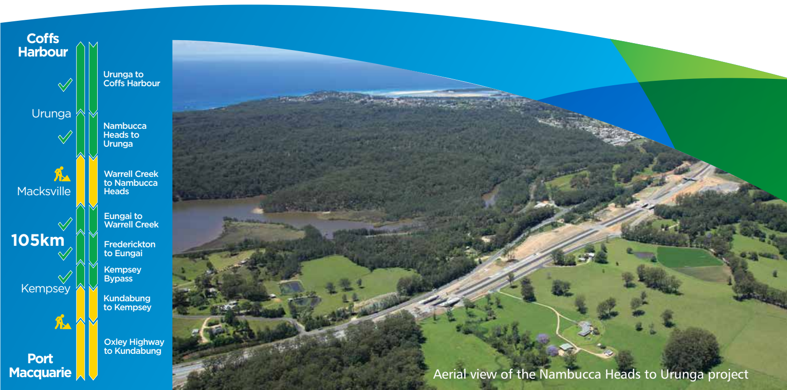
Aerial view of the Nambucca Heads to Urunga project