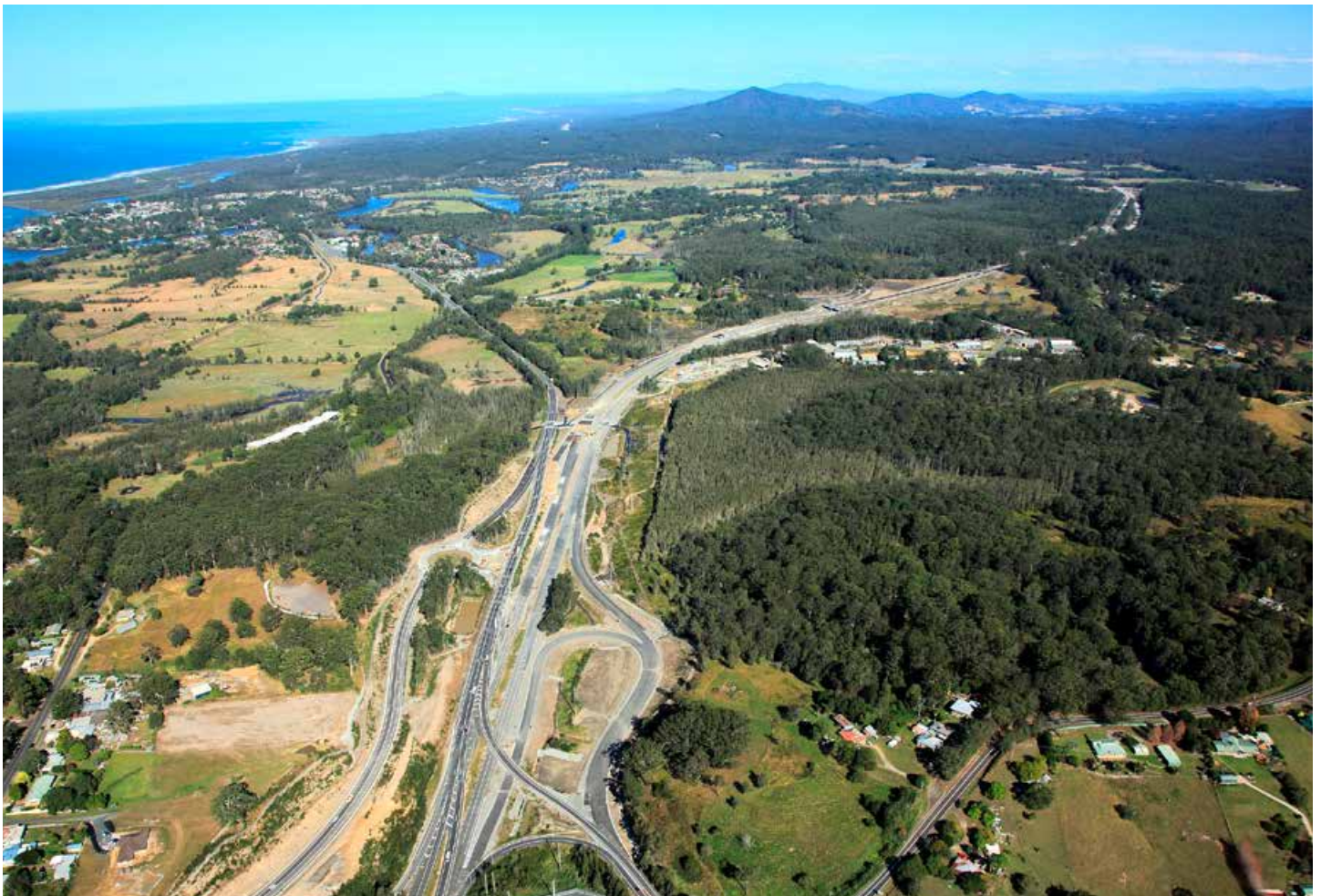
Aerial view of the upgrade to Waterfall Way interchange near Raleigh

In person at the Community Display Centre and site office on Ballards Road, Valla, Monday to Friday from 9am to 5pm (excluding public holidays).