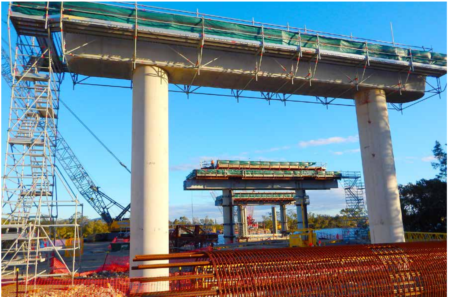
Pilecap, piers and headstock at the new Nambucca River bridge