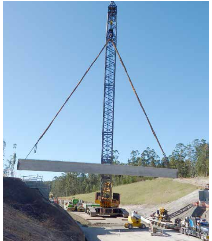
Lifting the single span girder onto Cockburns Lane bridge

In person at the Community Display Centre at 124 Albert Drive, Warrell Creek, Monday to Friday from 9am to 5pm (excluding public holidays).