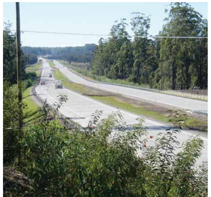
Looking north over Johnsons Creek

In person at the Community Display Centre and site office, 229 Cooks Lane, Clybucca NSW 2441, Monday to Friday between 9am and 5pm (excluding public holidays).