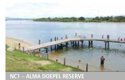
NC1 – ALMA DOEPEL RESERVE

Turn left onto the Old Pacific Highway and then right into Mylestom Drive (signposted Repton/Mylestom). On the 5km drive to Mylestom (a delightful coastal village nestled between the river and the ocean) you follow the north bank of the Bellinger River, passing paddocks and old stock yards. At the end of the road is the Alma Doepel Reserve NC1 , which is a perfect location for a family picnic, with a tidal enclosed