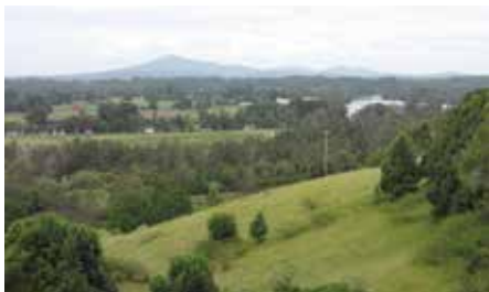
NC3 – PERRYS PARK LOOKOUT

Make a sharp right just after Tuckers Rock cottage and descend to the car park NC2 . Here you can walk the Bluff Loop Trail (1.8km) or the Bundageree Rainforest Walk (6km return). Returning along Tuckers Rock Road, go straight ahead at the crossroads into Perrys Road and after another 1km you come to Perrys Park Lookout NC3 , where you get scenic vistas west to the mountains and