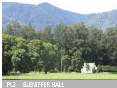
PL2 – GLENIFFER HALL