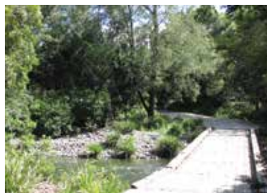
PL3 – NEVER NEVER BRIDGE

At the crossroads PL2 go straight ahead. On the right, is the Gleniffer Hall (School of Arts 1918). Cross the Never Never River – at the Keogh Reserve on the right you can picnic in the park and have a swim at a calm swimming hole.