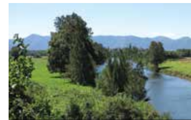
SC10 – ROTARY LOOKOUT, MARX HILL

This drive visits the settlements of Repton and Mylestom as well as rivers, beaches and forests.