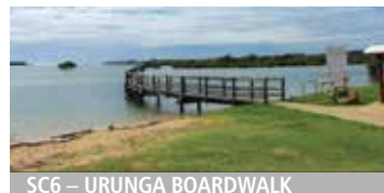
SC6 – URUNGA BOARDWALK

After crossing the railway bridge on Hungry Head Road, continue ahead (give way!), and take the one-way drive (1.5km loop) down to Hungry Head Beach SC5 , with a perfect paddling lagoon and of course ocean swimming (patrolled in school holidays – October to Easter). Next to the Surf Club, other facilities include toilets, picnic tables and BBQs (wood). Back on Hungry Head Road, go straight ahead (give way!), heading north to Urunga.