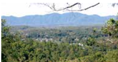
SC1 – VIEW FROM BELLINGEN LOOKOUT

This drive takes in the towns of Brierfield, Raleigh and Urunga, and covers a wide range of scenery – creeks and rivers, rainforest, eucalypt forests, paperbark swamps and mangroves, as well as fertile rolling farmland and stunning beaches. Opportunities for oceans swims and boardwalks.