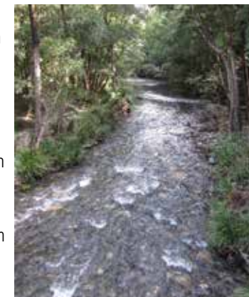
PL4 – NEVER NEVER RIVER

Returning to the Gleniffer crossroads, you can go straight ahead to return to Bellingen, or take optional side trip 5.